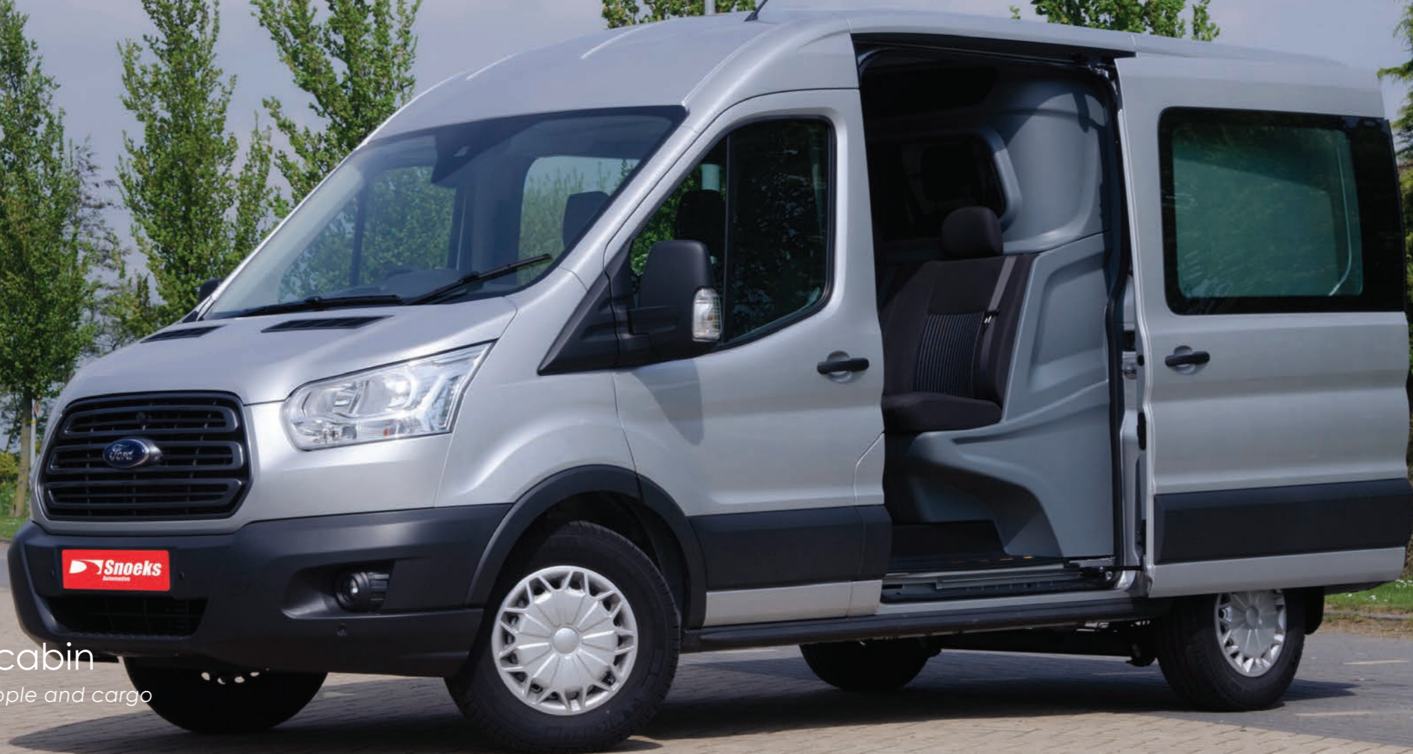
Ford Transit double cabin perfect combination between people and cargo